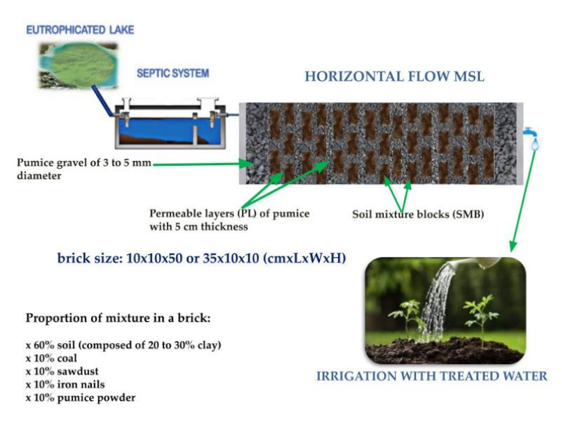
From Water 2022, 14, 686

in Strawberry Fragaria vulgaris under Hydroponic Culture. Toxins 2022, 14, 198. https://doi.org/10.3390/toxins14030198.